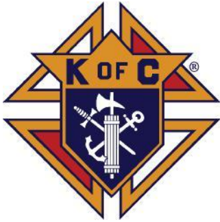
SK Bernie Iwasczynyn Council 9102 Grand Knight